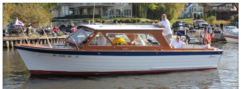
A few of the boats in the Saturday boat parade