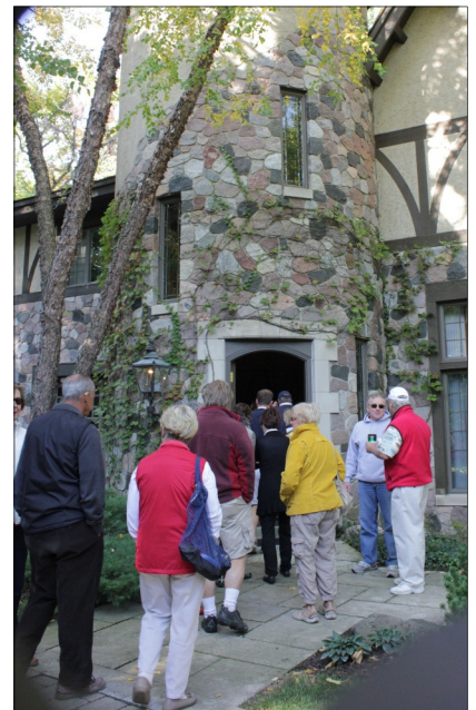
Entrance to what we called "the ultimate man cave" at the Buntrock Estate