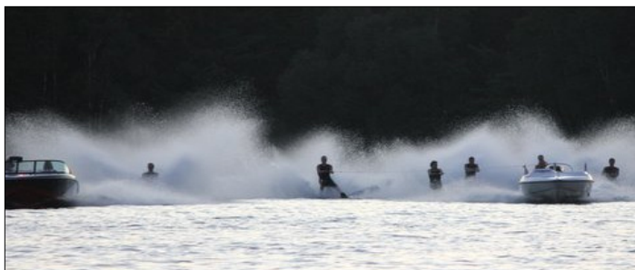
Min-Aqua-Bats step out to barefoot during the ski show