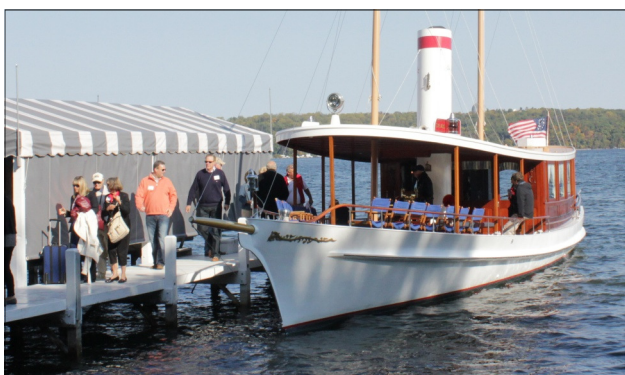
← Passengers disembark Sea Lark for Estate Tour