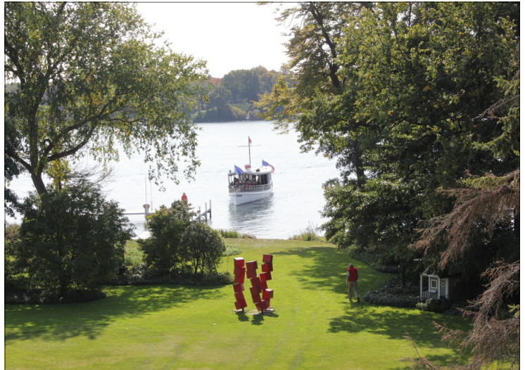
Polaris docking at the Deutsch-Kinnebrew Estate with one of the many sculptures & show volunteers in foreground