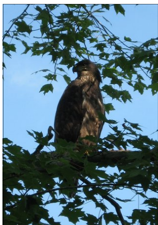
A Young Eagle

The Minocqua Antique and Classic Boat Show is unique and special for many reasons. As with most shows, this one is about getting the boat owners and public together to share their love and stories of these antique and classic beauties. In addition to that, this show's goal is also to raise money for the Multiple Sclerosis Society. A good time is had by all in this fantas-