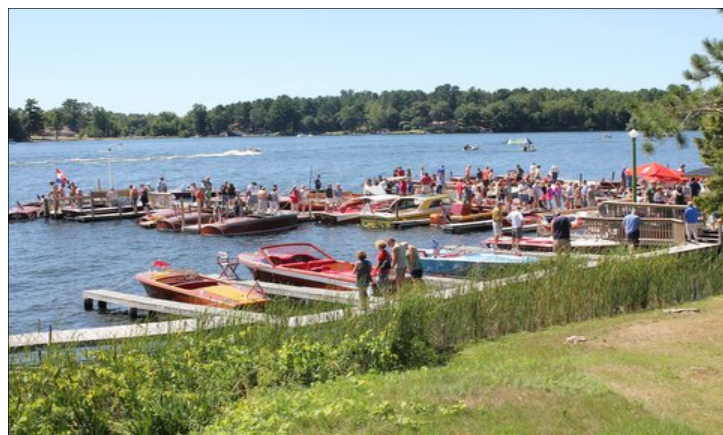
Spectator's Enjoy Viewing the Boats