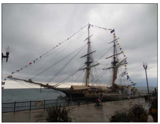
<sup>'</sup>Pride of Baltimore II' Reproduction of an1812-era topsail schooner known as Baltimore Clippers