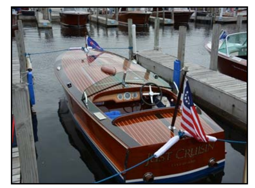
2nd Classic Utility Under 21' - Doug Tracy 1950 Chirs Craft Gentleman's Racer 'Just Cruisin'