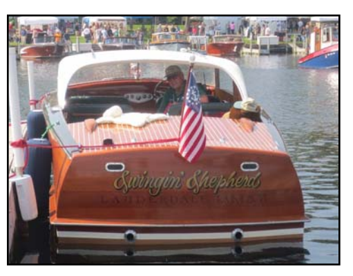
Best Classic Cruiser Under 30' - Gerald Petersen 1954 Shepherd 'Swingin' Shepherd'