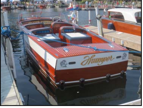
2nd Classic Utility 21' & Over - William Budych Jr. 1962 Budych-Hacker Utility 'Thumper'