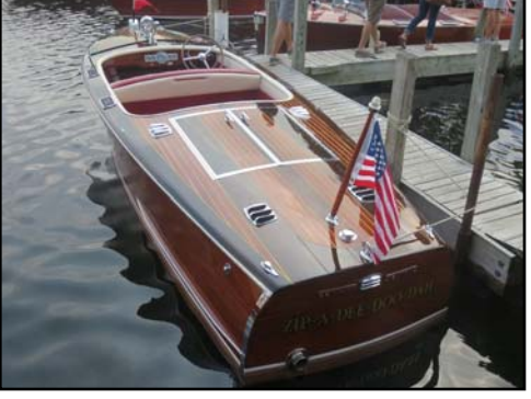
Best Classic Runabout Under 21' - Gary Conger 1947 Century Sea Maid 'ZIP-A-DEE-DOO-DAH'