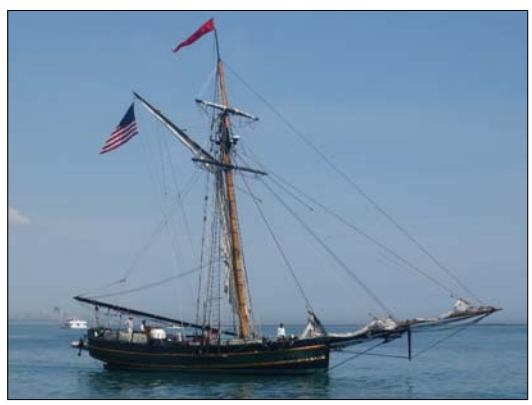
'Friends Good Will' Replica of a merchant ship turned man-o-war which had a role in the War of 1812

'El Galeon Andalucia' The 170' ship is a replica of 16th century galleons that were part of Spain's West Indies fleet. This vessel is an awesome sight to behold and was a fascinating experience to be aboard.