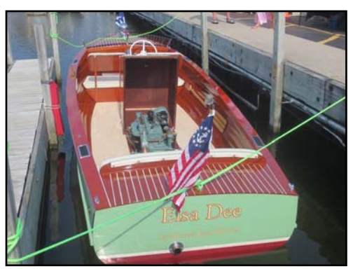
Best Antique Utility - Don Bergman 1936 Sunflower Deluxe Guide Boat 'Elsa Dee'