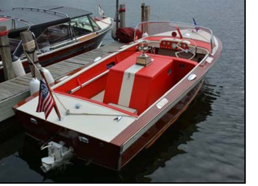
Best Classic Utility Under 21' & Best Century Pat Wichman 1961 Century Resorter 'Wicked Wood'