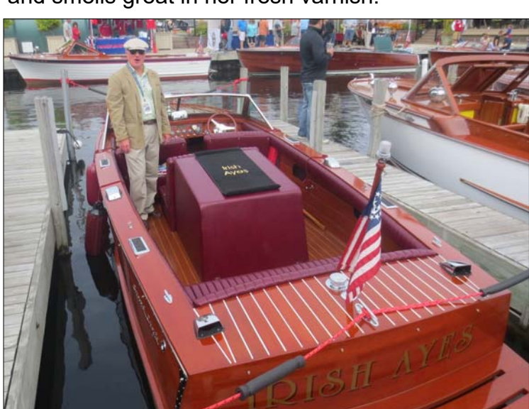
Ross Lynch aboard the beautiful 'Irish Ayes' 2003 Grand Craft

Thanks again to everyone that helped make this event happen including all the great folks that came out to see the show. And thanks especially to all the Captains and Mates and Crew for showing and sharing their fine old boats.