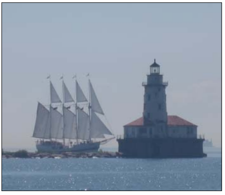
Chicago's 'Windy' Built as a modern interpretation of the last days of commercial sail.