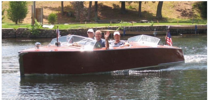
1930 Dodge Triple

OUR SPECIALITY IS REFINISHING YOUR BOAT BE IT PAINT OR VARNISH