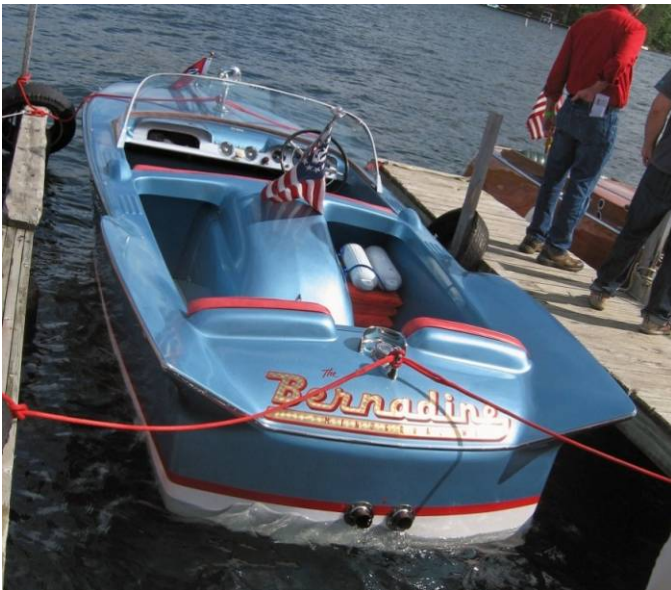
Chris Craft Silver Arrow

A good showing of about 30 boats went out to line up for the Friday night boat parade that opens the Min-Aqua Bat water ski show. Unfortunately, that is when the serious rain started, and most headed for the cover of the Hwy 51 bridge, although a few very intrepid crews donned jackets, hats or seat cushions over their heads and did the parade in the rain. Anyone who stayed past the rain was treated to an exceptional rainbow as the sun again appeared briefly before dusk.