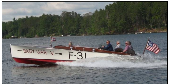
Baby Gar V

Sunday was much better, although still cool, like the midwest has been all summer so far. There was a great assortment of about 45 boats on display, from beautiful canoes, some very nice outboard boats, a rare fiberglass Chris Craft Silver Arrow, up to a 26' twin screw Continental, and crowned by a stunning reproduction the 1923 33' Gentlemen's racer Baby Gar V, courtesy of Mahogany Bay, which took the spectator's choice award hands down.