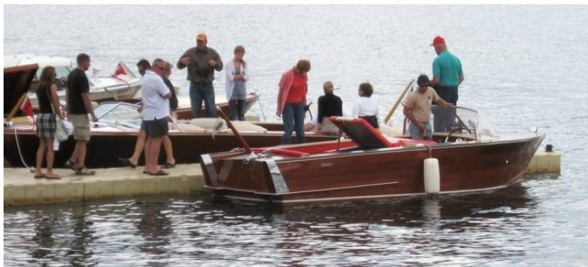
Love those fins